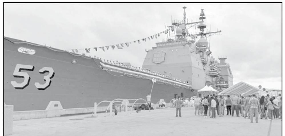
Cruiser Mobile Bay sits pier side during her decommissioning ceremony.