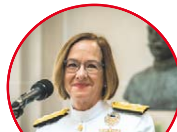
FRANCHETTI TAKES THE HELM AS ACTING CHIEF OF NAVAL OPERATIONS

San Diego Navy/Marine Corps Dispatch www.armedforcesdispatch.com 619.280.2985 Serving active duty and retired military personnel, veterans and civil service employees