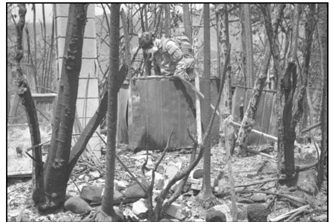
(from top) Search and rescue Soldiers and Airmen assist Maui County and state officials in search and recovery efforts in Lahaina, Maui, Hawaii, Aug. 10.