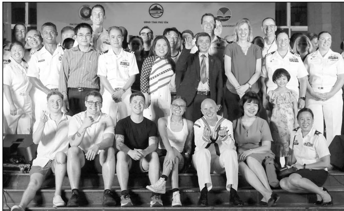
TUY HOA, Vietnam (Aug. 11, 2023) - Pacific Partnership 2023 gathers on stage at Phu Yen University, Aug. 11 to celebrate the end of a successful music exchange with the students at the university. Now in its 18th year, Pacific Partnership is the largest annual multinational humanitarian assistance and disaster relief preparedness mission conducted in the Indo-Pacific.

I suggest you contact Social Security at 1.800.772.1213 (or at your local office) and tell them you want to provide them with an estimate of your 2023 earnings because you are working and collecting early Social Security benefits. They will work with you to suspend your benefits for an appropriate number of (additional) months to avoid another overpayment situation. Note, you’ll likely need to do this each year you continue to work full time, until the year you reach your full retirement age when the earnings limit more than doubles. The earnings limit goes away when you reach your full retirement age.