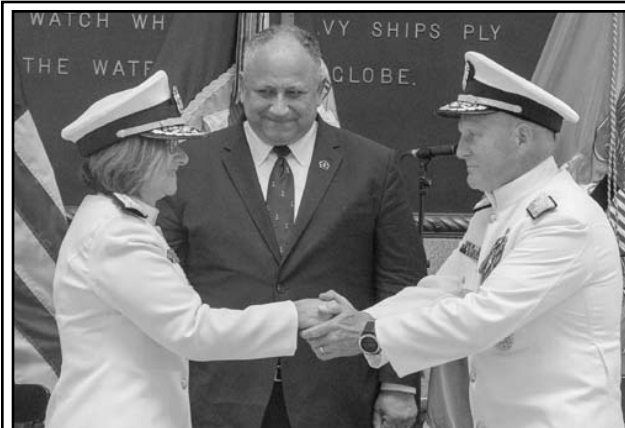
NAVAL ACADEMY (Aug. 14, 2023) Secretary of the Navy Carlos Del Toro, center, looks on as Adm. Lisa Franchetti, left, assumes responsibilities as acting chief of naval operations during a relinquishment of office ceremony for Adm. Michael M. Gilday.