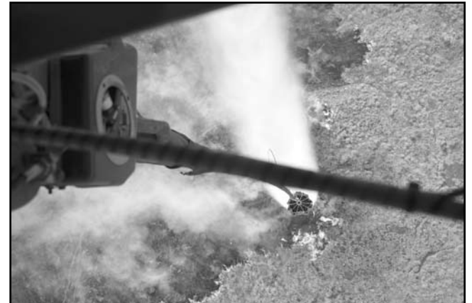
(below) A military aircraft participates in an aerial water bucket drop to fight the wildfire.

Refer to https://www.defense.gov/News/News-Stories/ .