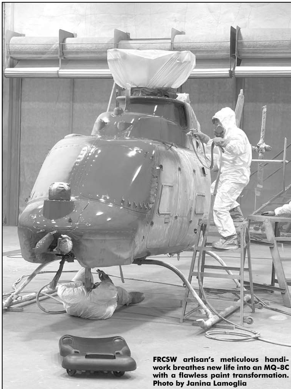
FRCSW artisan's meticulous handiwork breathes new life into an MQ-8C with a flawless paint transformation.