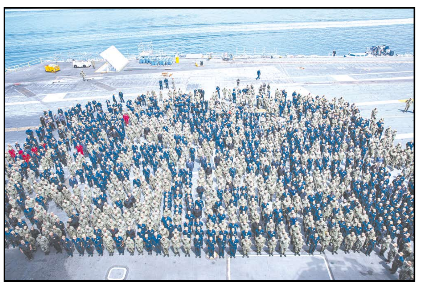
ATTENTION ON DECK: Sailors form ranks before the arrival of their commanding officer for an all hands call on the flight deck of aircraft carrier USS Abraham Lincoln Aug. 31, 2023. Abraham Lincoln is moored pierside at Naval Air Station North Island.

SIXTY-THIRD YEAR NO. 16 SEPTEMBER 7, 2023