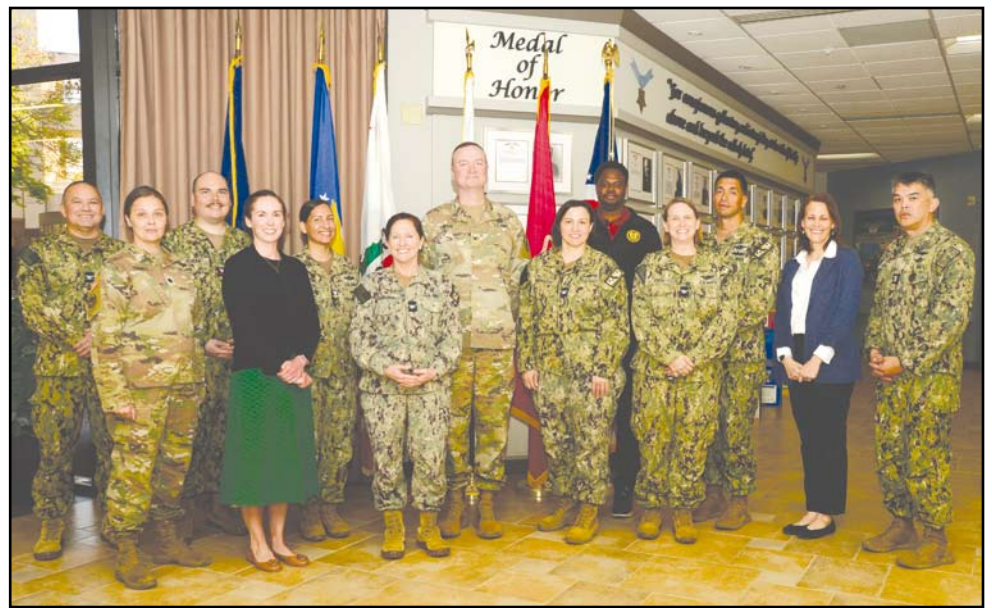
Uniformed Services University of Health Science Brigade leadership and Naval Medical Center San Diego leadership and team members pose for a group photo at NMCS D, April 24, 2024. Navy Medicine Readiness and Training Command San Diego's mission is to prepare service members to deploy in support of operational forces, deliver high quality healthcare services and shape the future of military medicine through education, training and research.

NMCS D employs more than 5,000 active-duty military personnel, civilians, and contractors in southern California to provide patients with world-class care anytime, anywhere. Anchored in Excellence, Committed to Health.