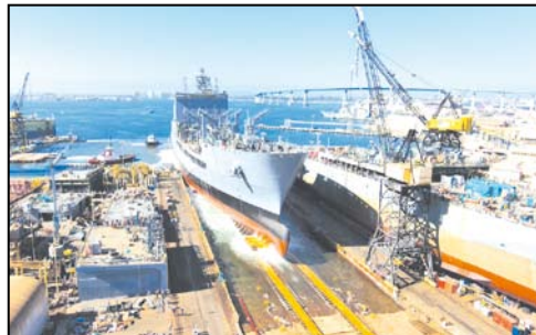
NASSCO file photo of USNS Earl Warren.

The ship honors Earl Warren, an American attorney, politician, and jurist who served as the 14th Chief Justice of the United States from 1953 to 1969. Warren wrote the majority opinions in landmark civil rights cases such as Brown v. Board of Education, Reynolds v. Sims, Miranda v. Arizona and Loving v. Virginia.