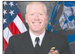
Official Navy bio photo of Vice Adm. John F. Wade.

MSC directs and supports operations for approximately 140 civilian-crewed ships that replenish Navy ships at sea, conduct specialized missions, preposition combat cargo at sea around the world, perform a variety of support services, and move military equipment and supplies to deployed U.S. forces. MSC exists to support the joint warfighter across the full spectrum of military operations, with a workforce that includes approximately 6,000 civil service mariners and 1,100 contract mariners, supported by 1,500 shore staff and 1,400 active duty and reserve military personnel.