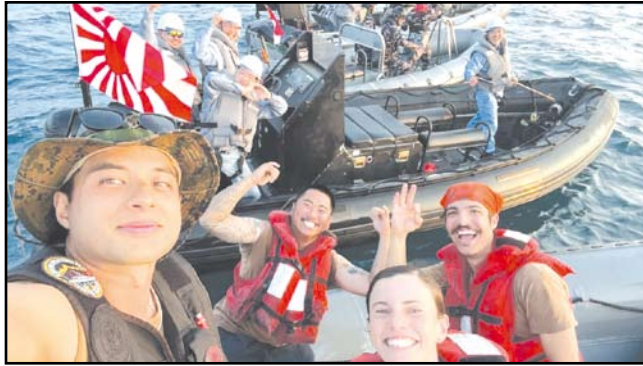
In this USS Halsey Facebook post from March 29, crewmembers take a break from small boat ops.

es excessive maritime claims around the world regardless of the identity of the claimant. Customary international law reflected in the 1982 Law of the Sea Convention protects certain rights, freedoms and lawful uses of the sea enjoyed by all nations. The international community has an enduring role in preserving the freedom of the seas, which is critical to global security, stability, and prosperity.