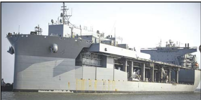
USS Hershel "Woody" Williams pulls into port at Libreville, Gabon, on May 5, 2024.

https://www.stripes.com/theaters/africa/2024-05-10/navy-woody-williams-grounded-africa-13817257.html