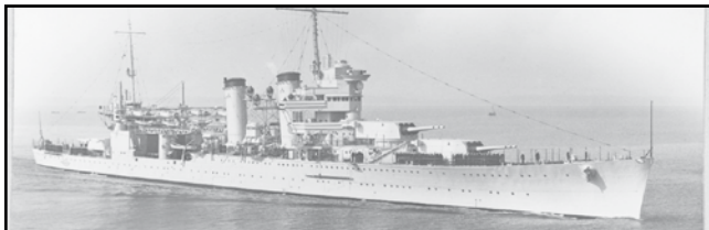
USS New Orleans, shown here in English waters, June 1934.

Find this story at https://www.navy.mil/Press-Office/News-Stories/display-news/Article/4272152/ .