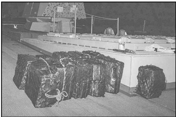
The Coast Guard Law Enforcement Detachment and Sailors aboard destroyer USS Sampson intercept contraband while conducting maritime intercepts diction operations in the Eastern Pacific, August 11.