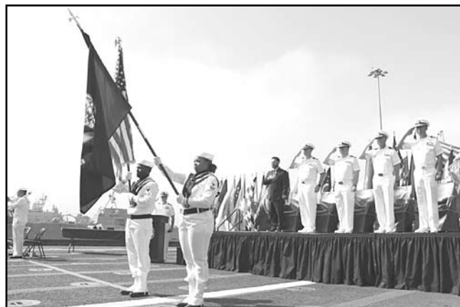
A Navy color guard presents the colors during a change of command ceremony for the Gold crew of USS Tulsa littoral combat ship Gold crew held at Naval Base San Diego, Aug. 22.