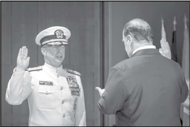
(top) Secretary of the Navy John Phelan administers the oath of office to Navy Adm. Daryl Caudle during an assumption of office ceremony at the Washington Navy Yard in Washington, Aug. 25. (below) Caudle delivers remarks.

“Your influence is woven into the very fabric of my being, into every decision I’ve ever made,” Caudle said. “From the moment we met, you’ve been the bedrock of my life. You’re the anchor that has kept me grounded, especially in the sometimes-turbulent seas of this profession.”