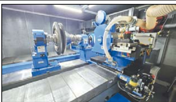
FRCSW is taking a giant leap forward by replacing decades-old, inefficient equipment with cutting-edge technology that dramatically boosts productivity, precision, and overall readiness.

FRCSW stands as a model of innovation and efficiency within military maintenance commands. The work done at the command exemplifies how smart engineering and modern technology can revitalize legacy programs and secure the future of naval aviation in support of the President's national defense strategy.