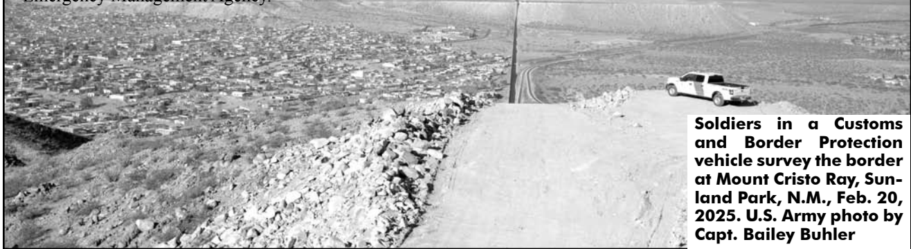
Soldiers in a Customs and Border Protection vehicle survey the border at Mount Cristo Ray, Sunland Park, N.M., Feb. 20, 2025.

Defense Department civilians can now apply for details of up to six months with the Department of Homeland Security to help support President Donald J. Trump’s priority of securing the southern border. DOD civilians were notified of the opportunity via e-mail Aug. 20. Civilians who would like to contribute to the southern border mission can do so by applying at the USAJOBS website. Following that action, DHS will review applications and initiate coordination with an employee’s organization to get approval for a detail to U.S. Immigration and Customs Enforcement, U.S. Customs and Border Protection or the Federal Emergency Management Agency.